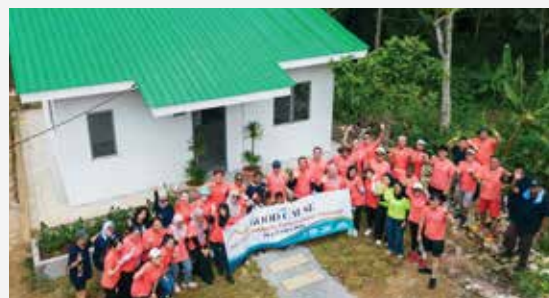
The OSK team in front of the newly-built house.

Additionally, we expanded the community hall to establish a library, furnishing it with tables and chairs. Stocked with books collected from our donation drive held from 1st to 31st August 2024 at our property sales galleries and group-managed properties, the library aims to enhance literacy among 112 children and youths in Kampung Paya Mendoi.