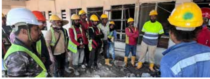
Safety awareness training at a construction site.