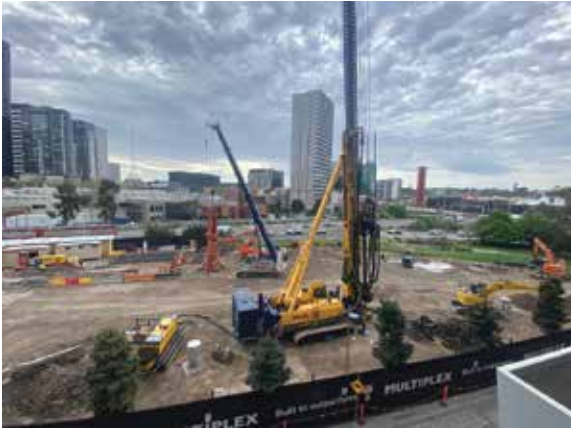
Melbourne Square site.

Our Construction Division is equally committed to managing water resources responsibly. Across all project sites in Malaysia, we have implemented management systems to prevent water pollution and conduct periodic water quality monitoring to ensure that all discharged water complies with the National Water Quality Standards for Malaysia and other prescribed quality standards. Water samples are sent to an appointed lab for testing, and records are maintained to verify compliance with environmental standards.