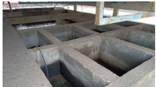
Cables Division’s water recirculating system.

Our Cables Division has been using a water recirculating system since 1997, reusing process water as a cooling agent for factory machines continuously throughout the manufacturing process, instead of discharging into waterways. Following a 2019 upgrade, water storage capacity increased by 71.3%, reaching 489 m 3 .